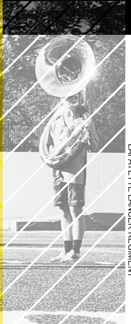
LAFAYETTE LANCER REGIMENT